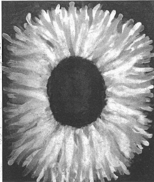
Clockwise starting from far left: The painting "Flowing River" demonstrates Mendoza's interpretation of nature. The artist's painting "Daisy Dreamer." The painting "Wise Tree" which inspired Mendoza's best-selling cotton fabric collection. To see more photos visit www.roundupnews.com/a-e or www.georgemendoza.com . Courtesy of George Mendoza